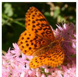
Great Spangled Fritillary

In late summer big, bold and beautiful Monarchs have our attention. But focusing in, we might see other butterflies that, up close, are just as spectacular. At The Quarry Farm we are seeing Hackberry Emperors, Tawny Emperors, Great Spangled