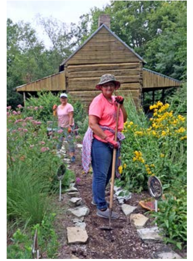
Master Gardeners tend to the pollinator garden.