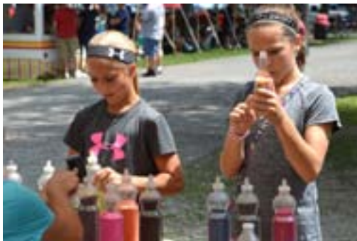
Scene from last year's event

The 103rd annual Ada Farmers' and Merchants' Picnic continues Saturday, Aug. 13, in the War Memorial Park.