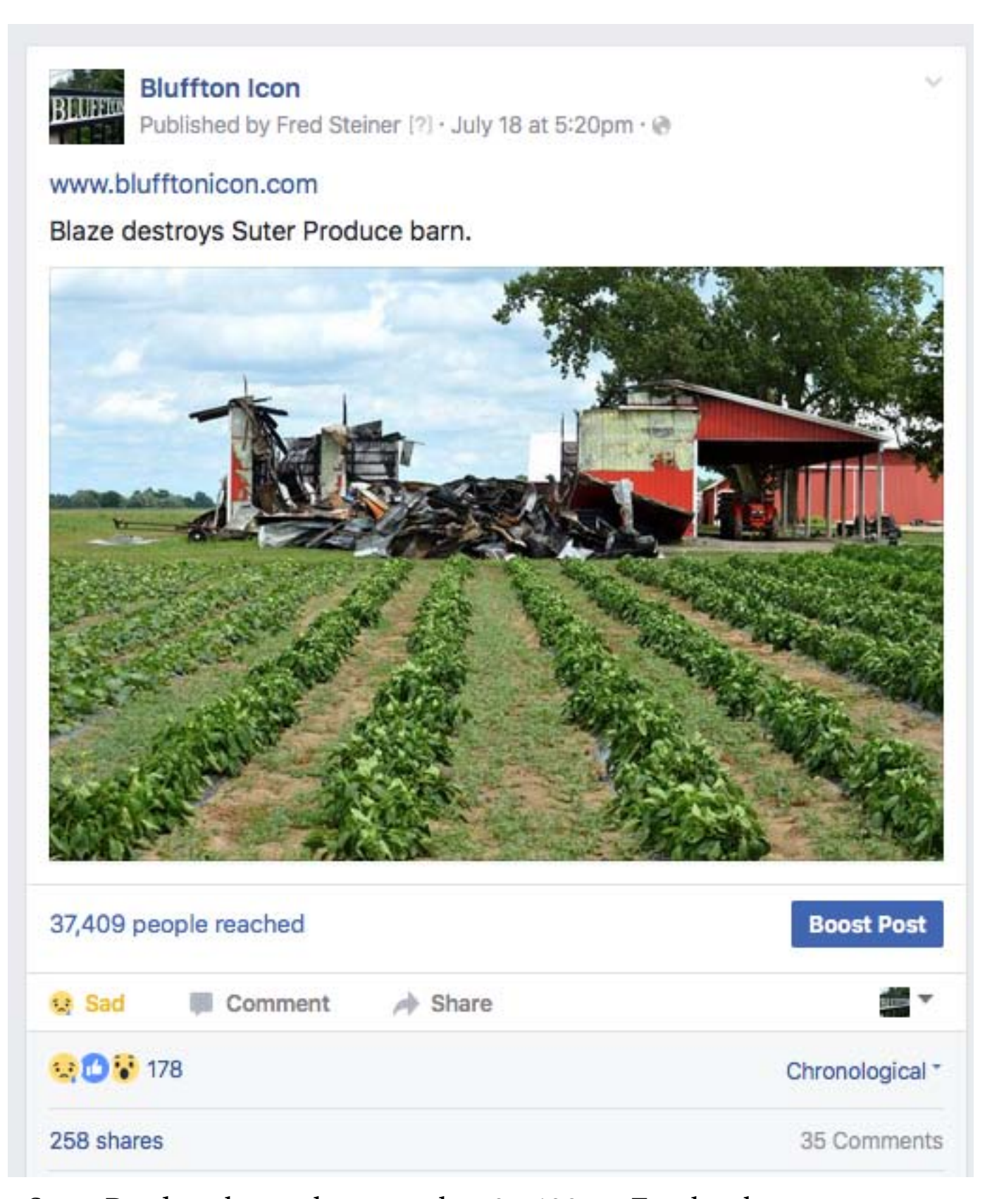
Suter Produce barn photo reaches 37,409 on Facebook

The biggest story on the Bluffton Icon last week involved the Suter Produce barn fire photo. It had 37,409 reaches on Facebook, 258 shares and 35 comments.