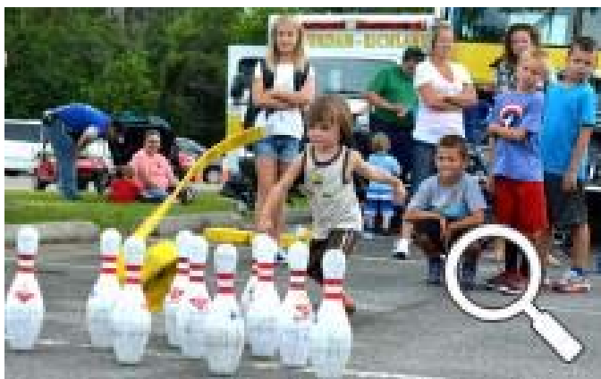
Scene from last year's Night Out

The Bluffton and Pandora police departments Tuesday, Aug. 2, from 6 to 9 p.m. at the Bluffton Community Swimming Pool, host the third annual night out.