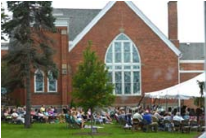
Scene from last year's worship service

Bluffton's annual summer community worship service is at 9 a.m., Sunday, July 31, in the Bluffton Presbyterian Church lawn. It is sponsored by the Bluffton Area Ministerial Association.