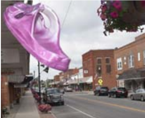
Purple shoes hanging on Main Street

The purple shoes hang on Main Street to remind people that cancer hits all walks of life and all kinds of people, according to Lynda Best of the Bluffton Relay for Life.