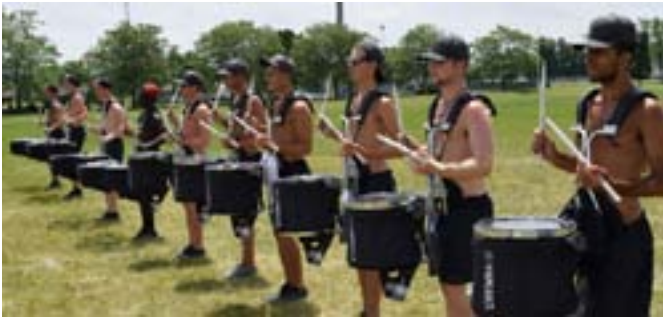
Drummers in The Cadets during rehears-