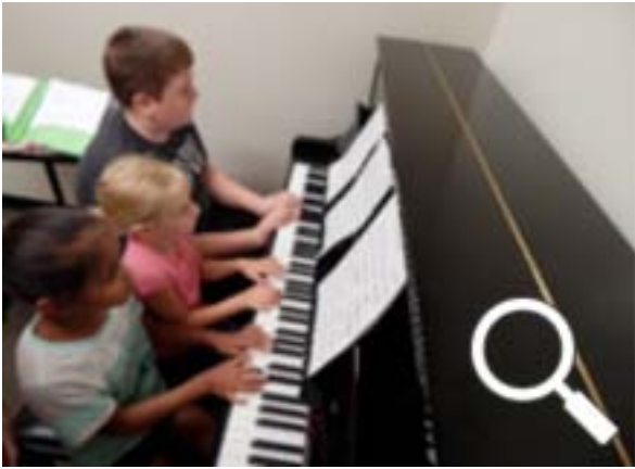
Piano rehearsal from last year