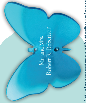
Actual representation of butterfly wall piece.