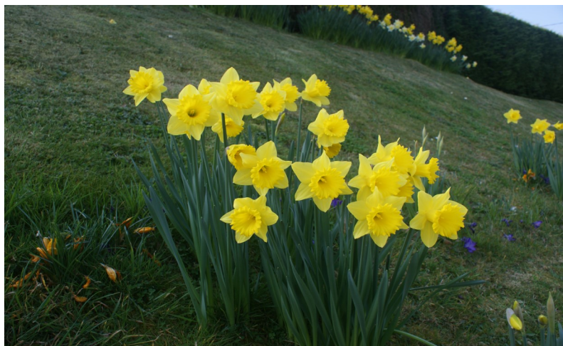
Daffodils are starting to bloom and soon tulips.