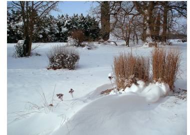
Even though the snow is still there the plants will be ready when it's gone.

Now is the time to start some seeds but remember to read the package and only start the ones that say to start inside eight to ten weeks before last frost, that is usually May 10-15. Have fun.