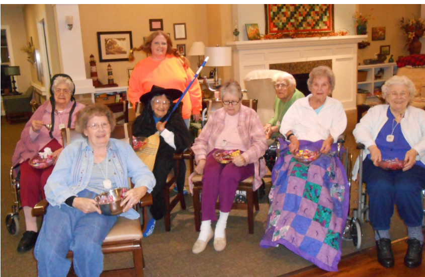
Elders at Frieda House enjoy Trick-O-Treat night. Some of the staff brought their children to enjoy the fun.