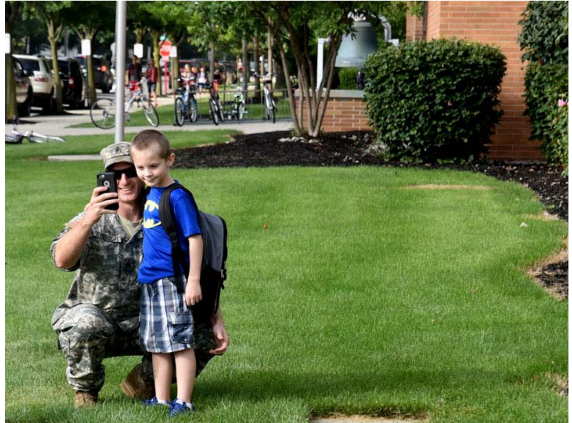
A selfie with dad.