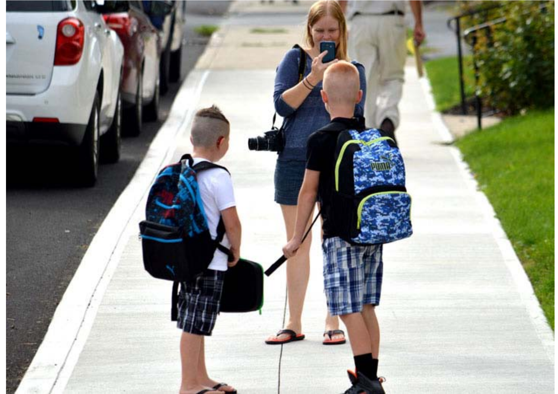
Photo across the street from the school.