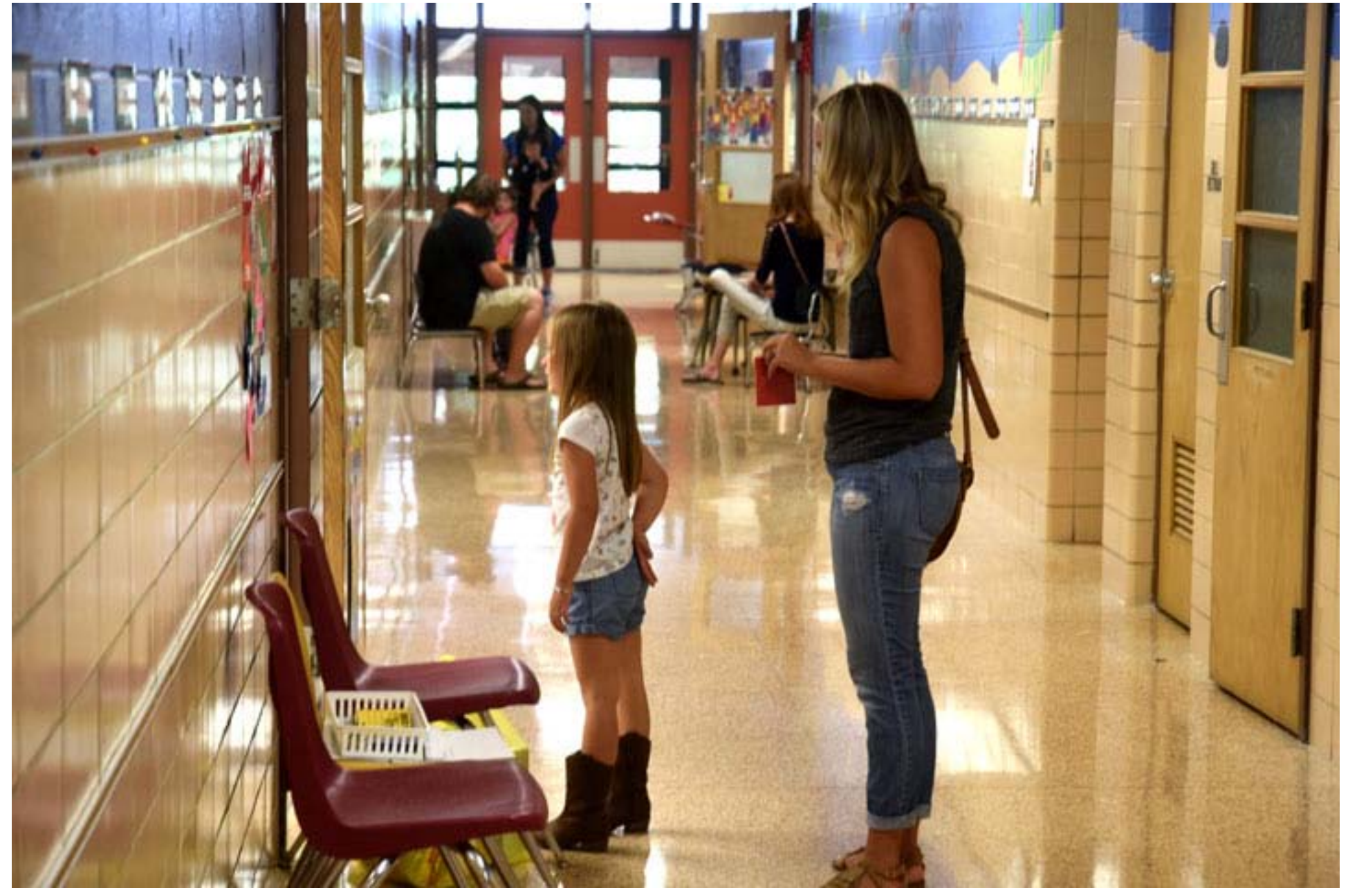
Is this my new classroom?