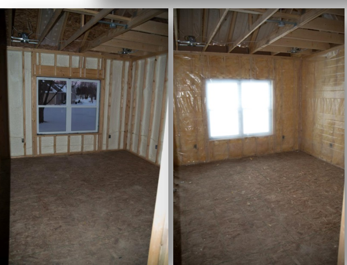
Insulation Sprayed On, Rolled On, and Blown In