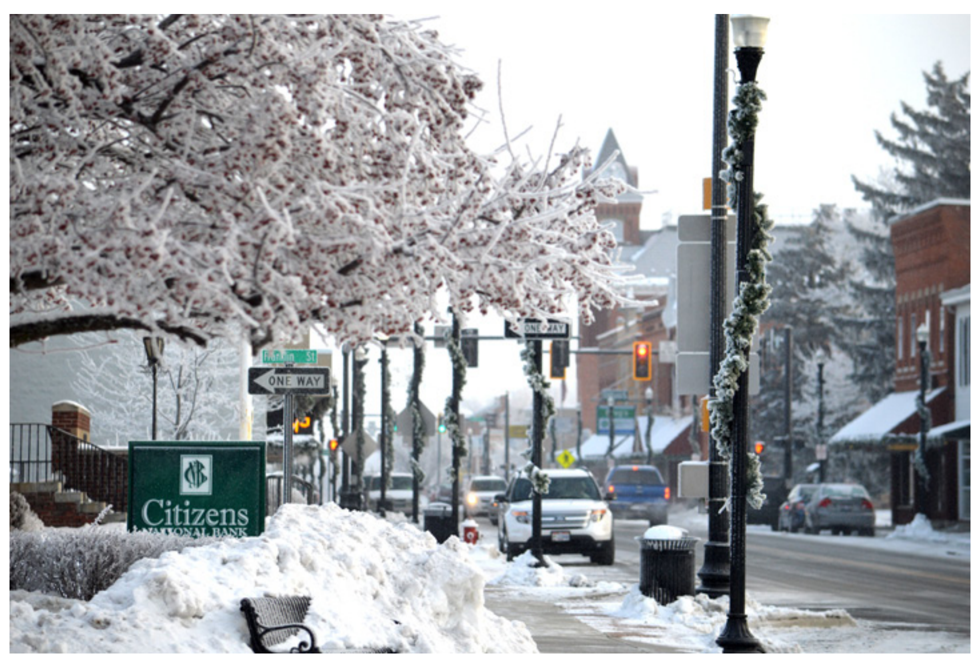
Under clear frosty nights in winter soft ice crystals might form on vegetation or any object that has been chilled below freezing point by radiation cooling. This deposit of ice crystals is known as hoar frost and may sometimes be so thick that it might look like snow.