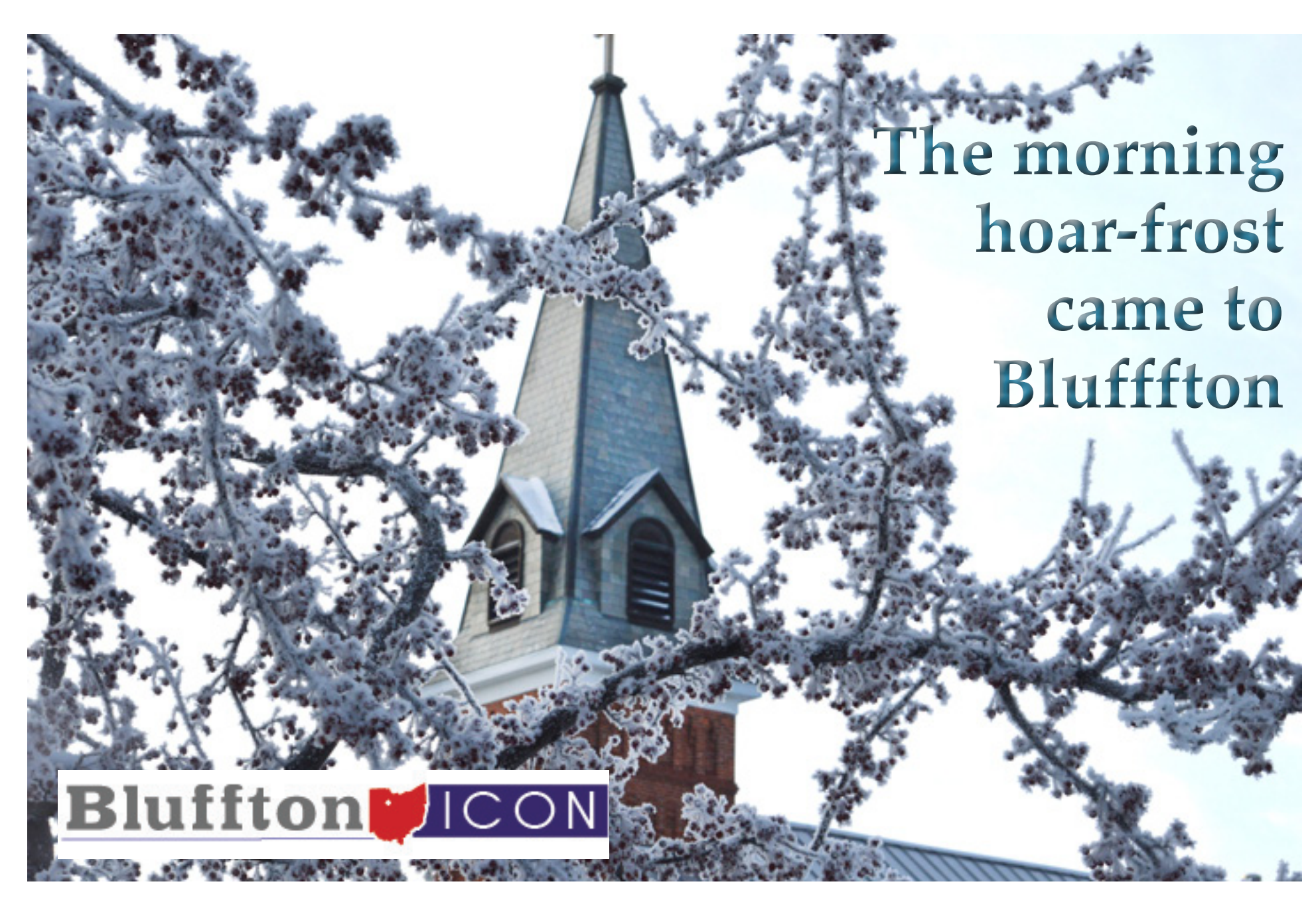
Bluffton scenes following a zero-degree hoar-frost in Bluffton on January 15, 2015