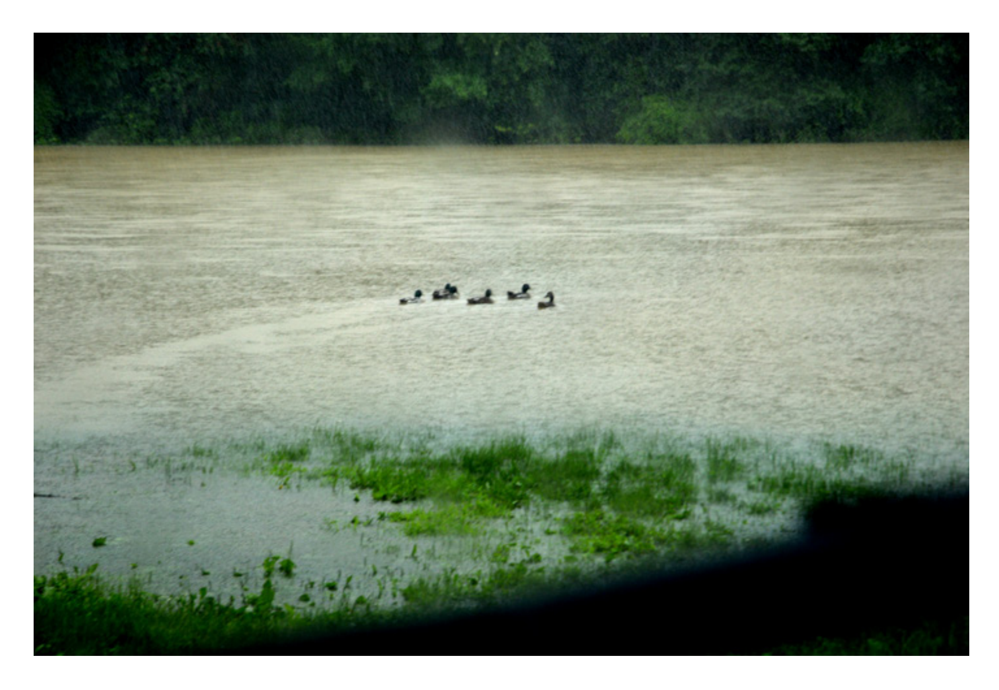
Ducks on the old baseball field near the Musselman Library on campus