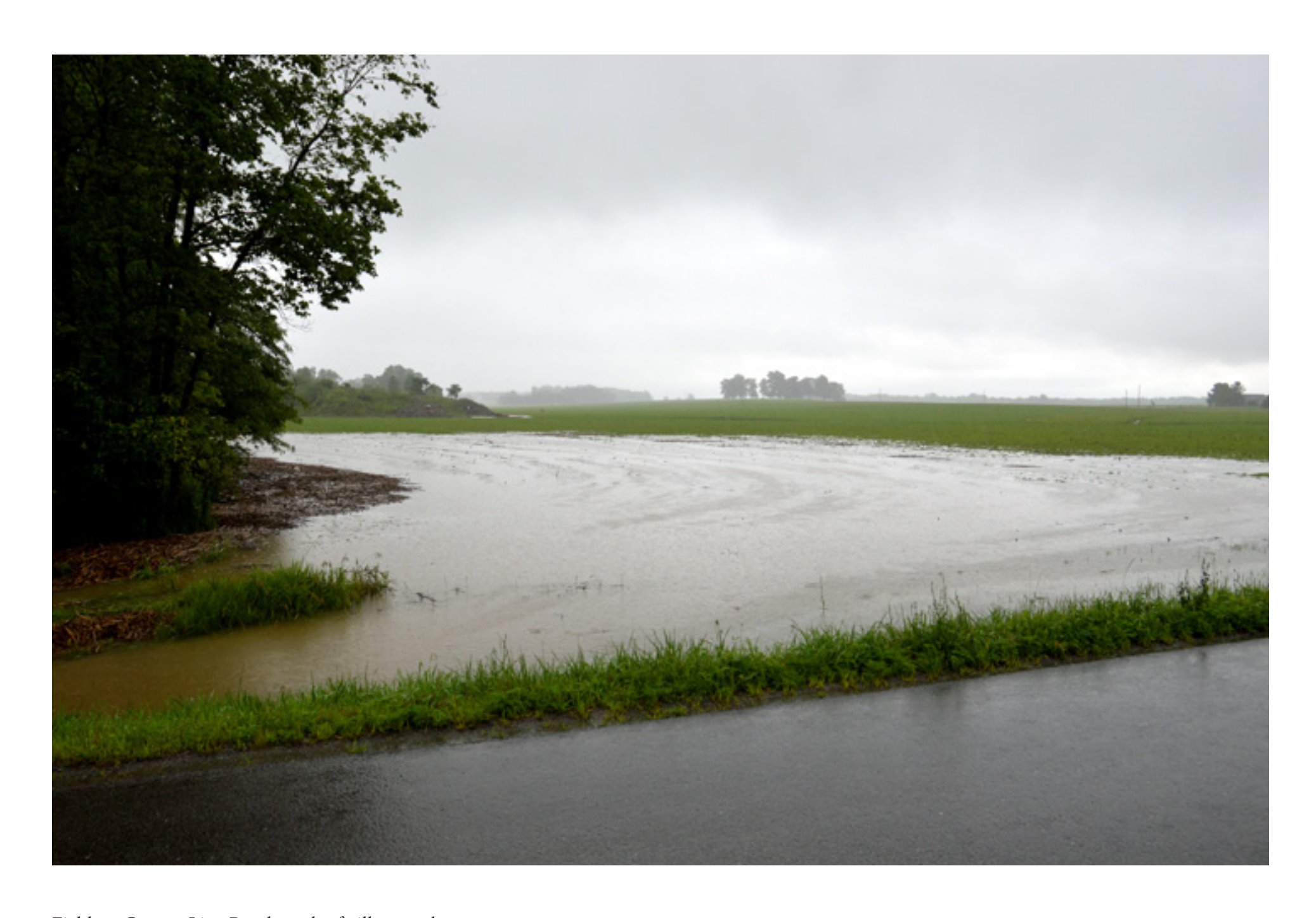
Field on County Line Road south of village park.