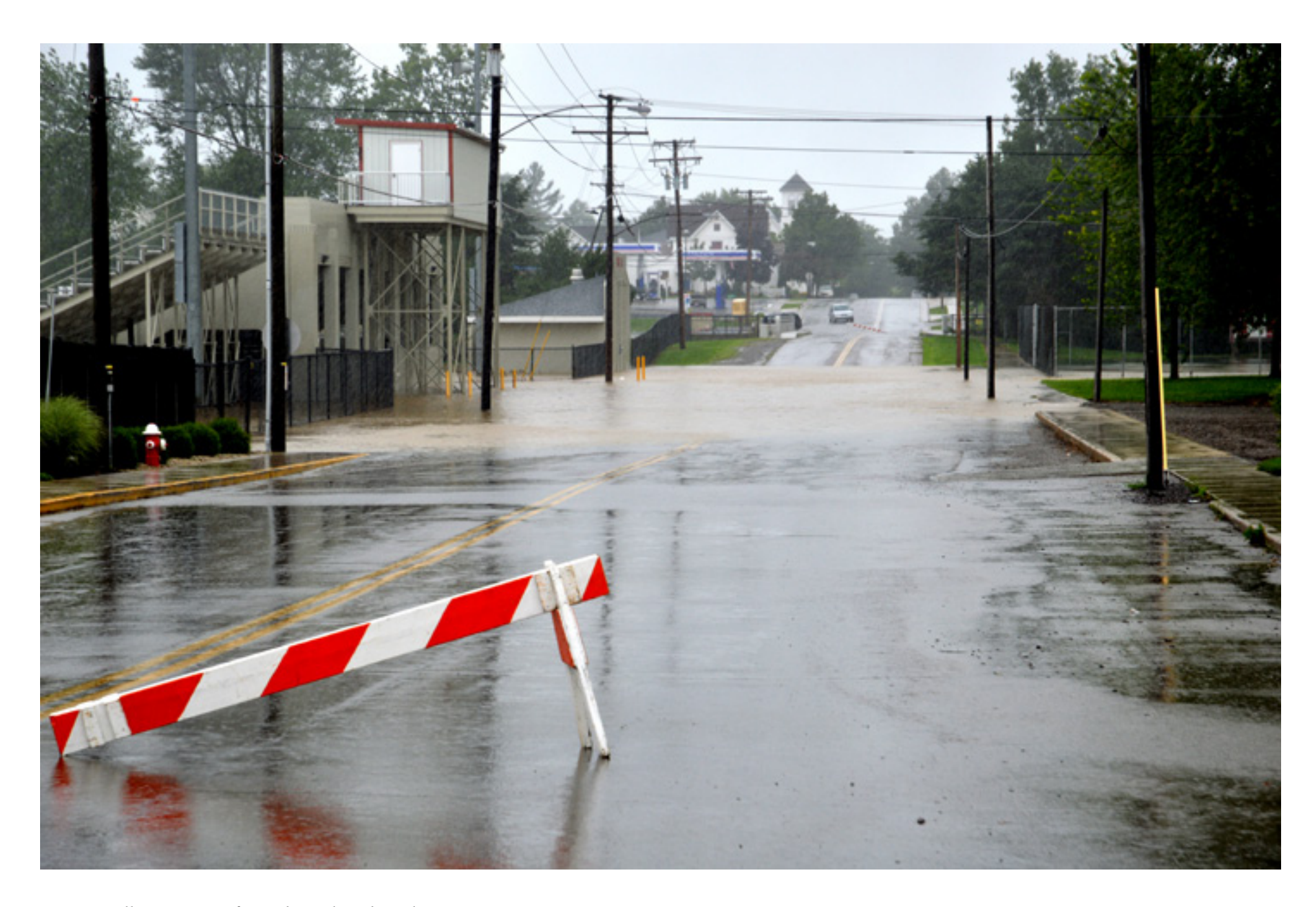
East College Avenue from the railroad track