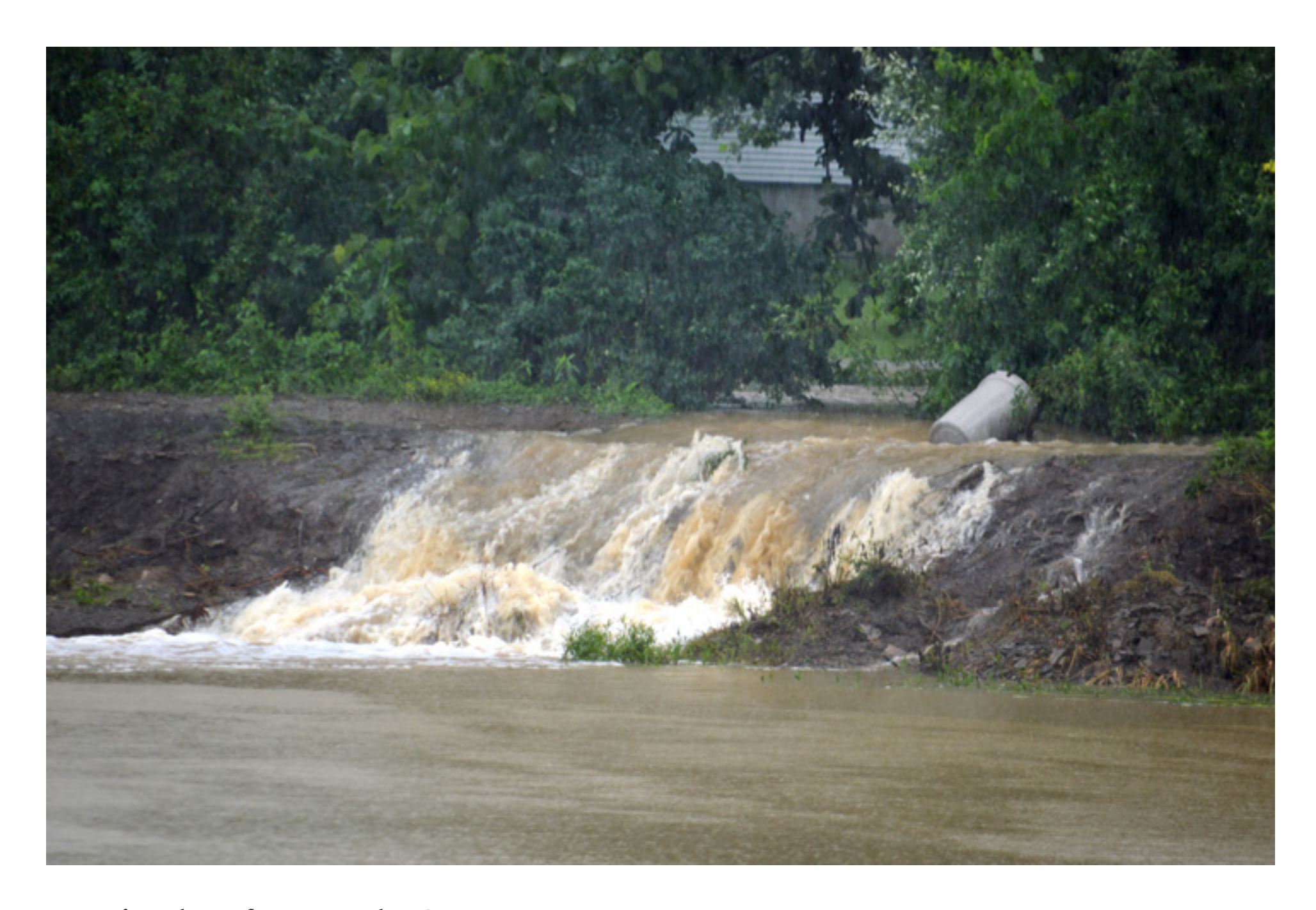
Waters of Big Riley overflowing into Buckeye Quarry