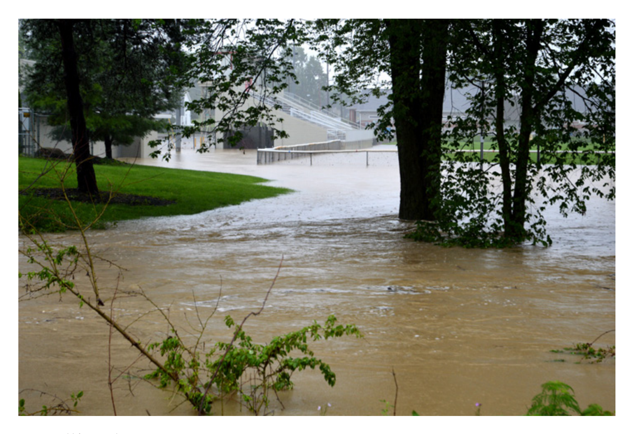
Harmon Field from Triplett Drive