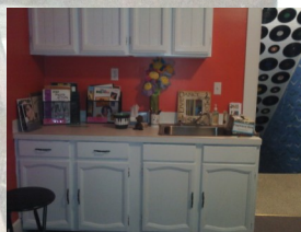
New waiting room colors and records!

We have enjoyed having the improved space, as it allows more freedom in scheduling for us and our other teachers - we hope you have been enjoying the improvements as well!