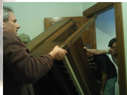
Moving in the piano - DON'T try this at home!