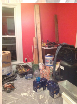
In Progress: A Huge Mess!

Our plan then was to break up the larger room into smaller rooms similar to a university or college-sized practice room in a music building. We split the larger room into three smaller rooms to maximize the space, added a new window, installed double drywall and laid new carpet for soundproofing.