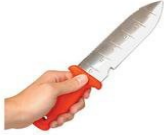
Deluxe Soil Knife

Preorders Recommended. A limited number of these tools will be available for purchase at the event.