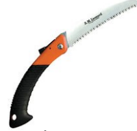
Folding Pruning Saw