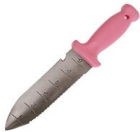
NEW! PINK Deluxe Soil Knife