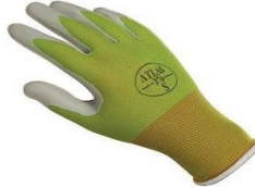
Back by popular demand! - Nitrile Gardening Gloves