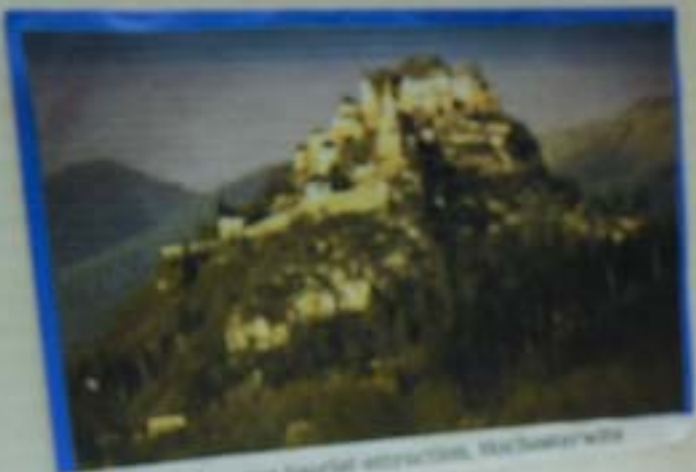
This is the famous tourist attraction, the Swabian Castle