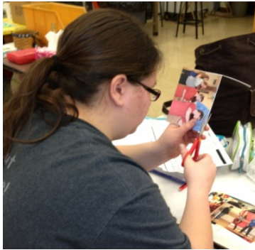
Student cutting out photos

To stay up to date in modern day photography, Bluffton High School has a variety of photo and video editing software, as well as digital cameras. Pupils are taught how to utilize the software to create videos and digital works of art. Adobe Photoshop Elements is used to patch together multiple pictures and perfect them. Students utilize Adobe Premiere Elements to create stop motion movies and other types of videos.