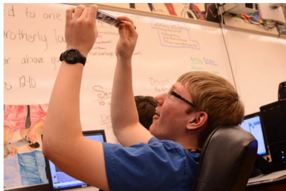
Student checking some negatives

Bluffton High School is setting the bar high for high school art programs. Old and new photography techniques must be taught in schools such as Bluffton High School in an effort to ensure that it stays alive, now and in the future.