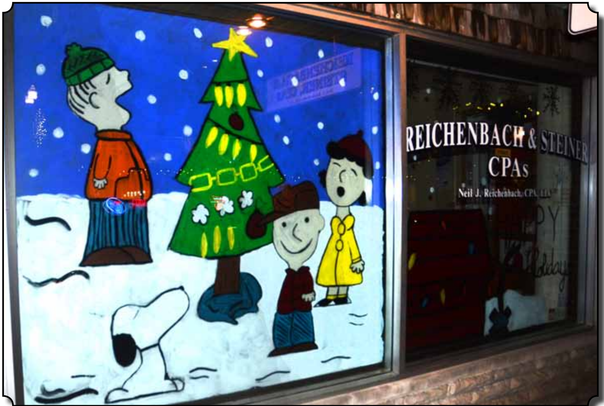
First place downtown window decorating contest Reichenbach and Steiner CPA, 140 N. Main St.