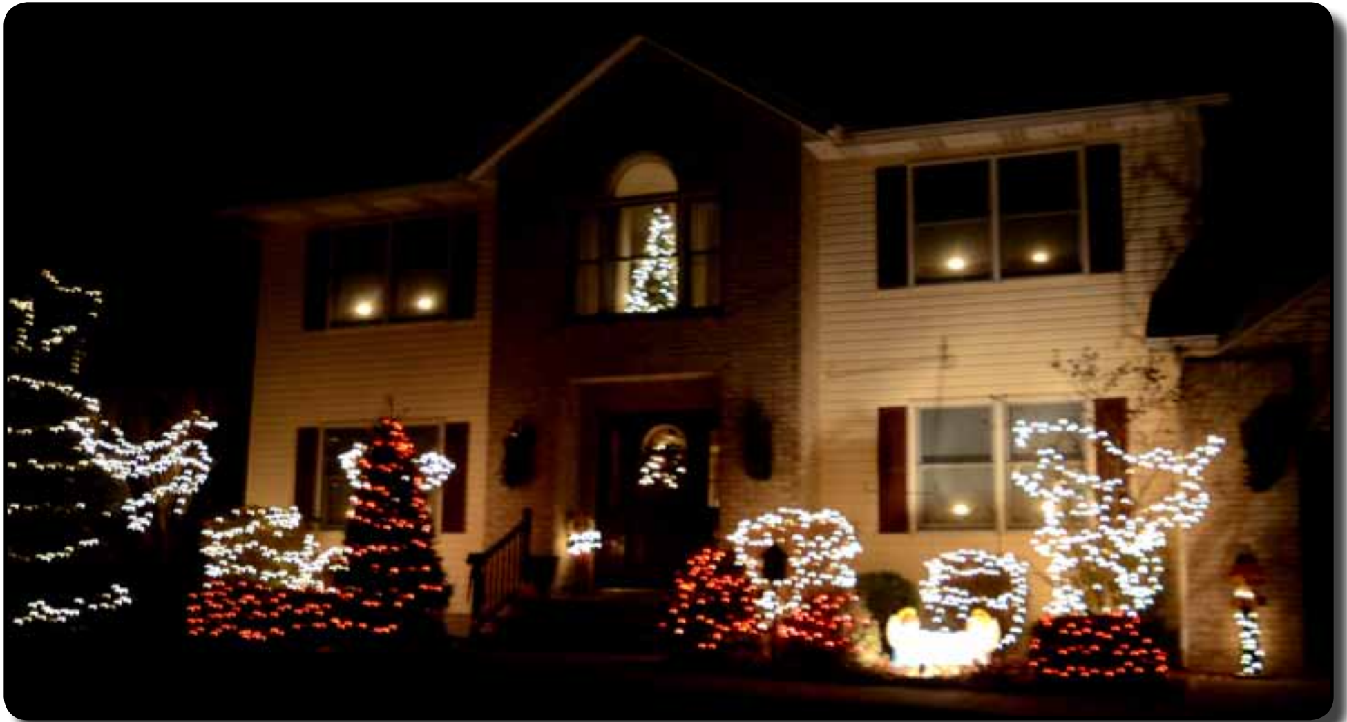
Best use of lights - residential lighting winners Keeler residence, 503 Greeding St.