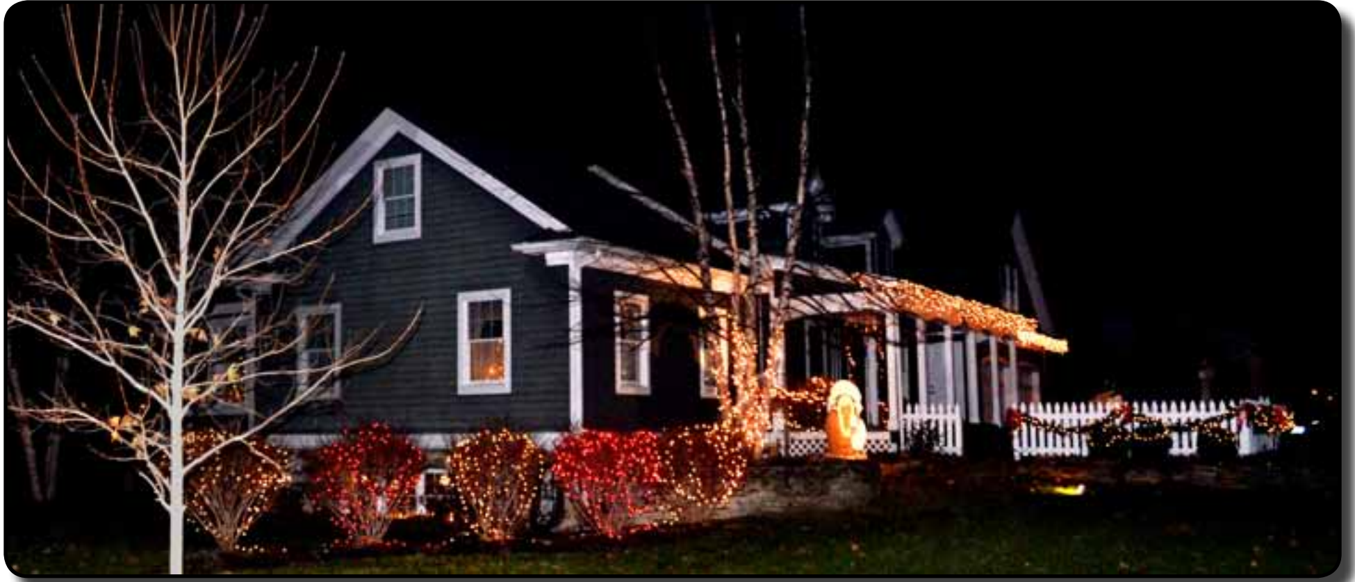
First place residential lighting winners Wehri residence, 229 Bentley Road