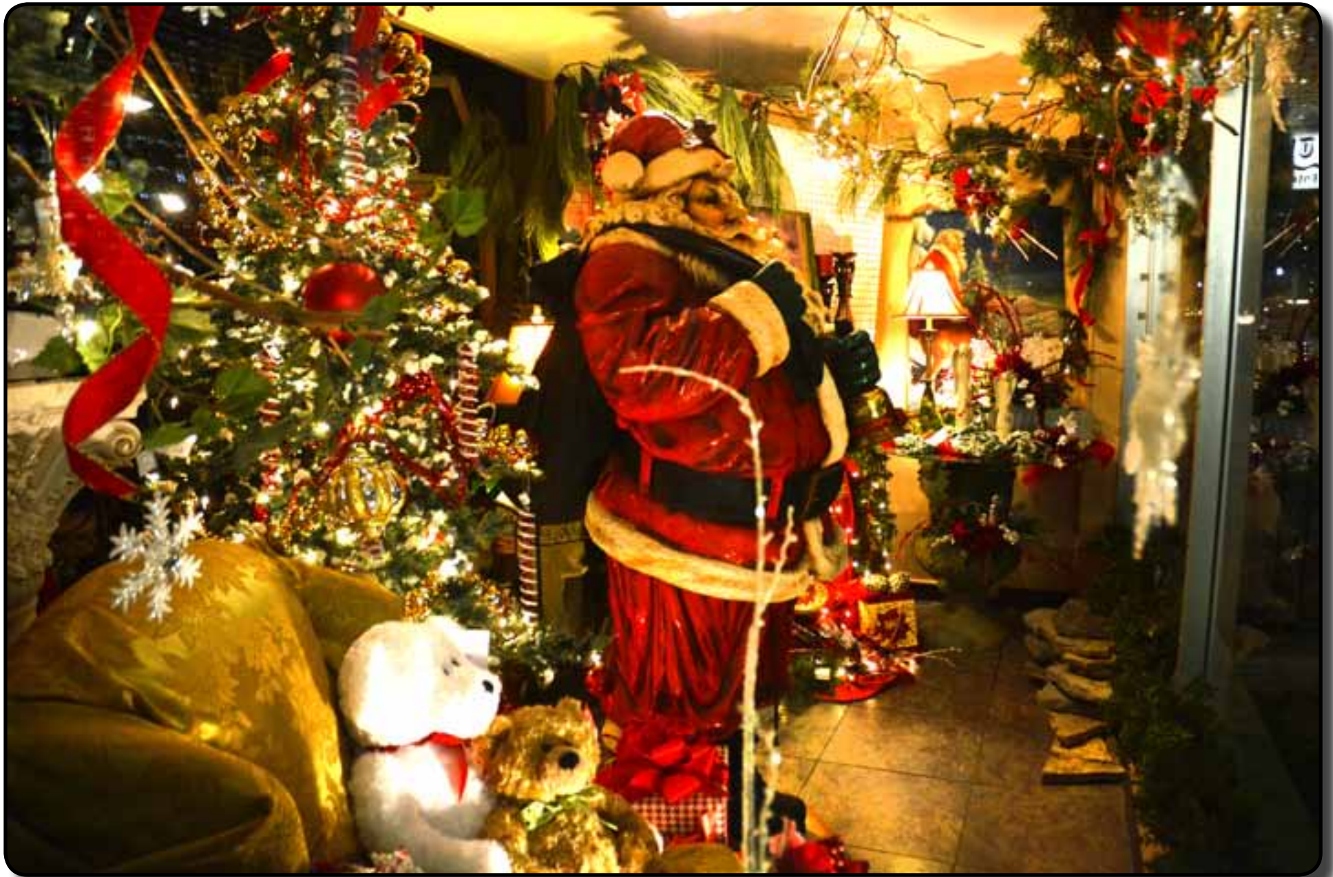
Second place downtown window decorating contest Town and Country Flowers, 121 S. Main St.