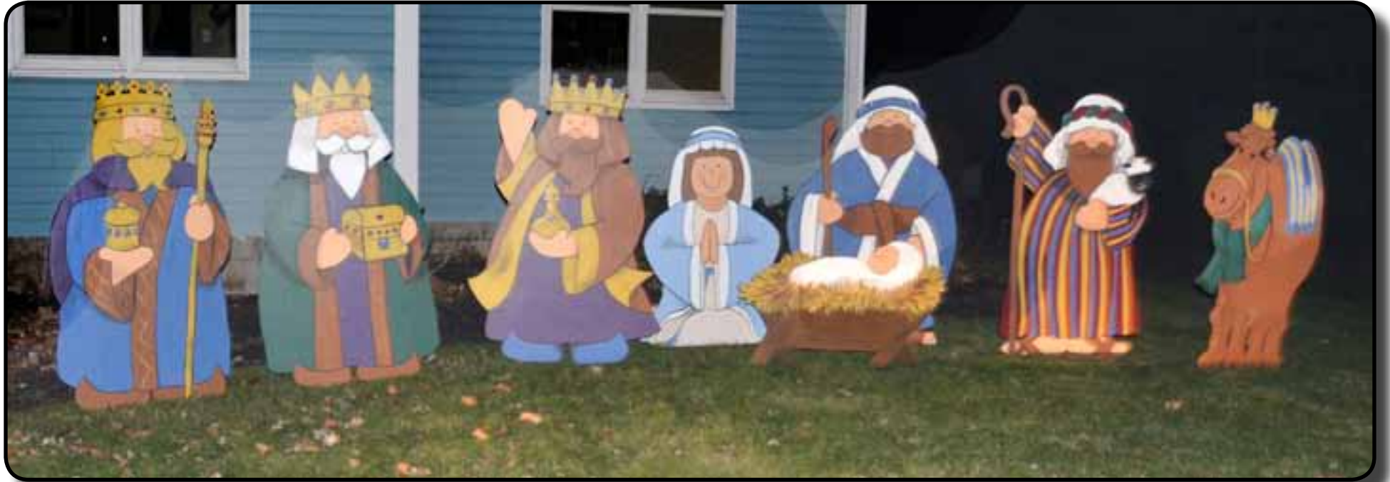
Best religious display - residential lighting winners Worcester residence, 120 Beaver St.