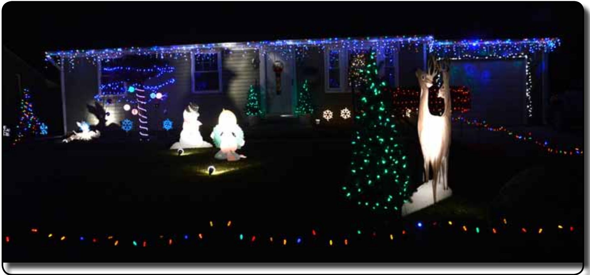
Second place residential lighting winners Housh residence, 120 Eastland Drive