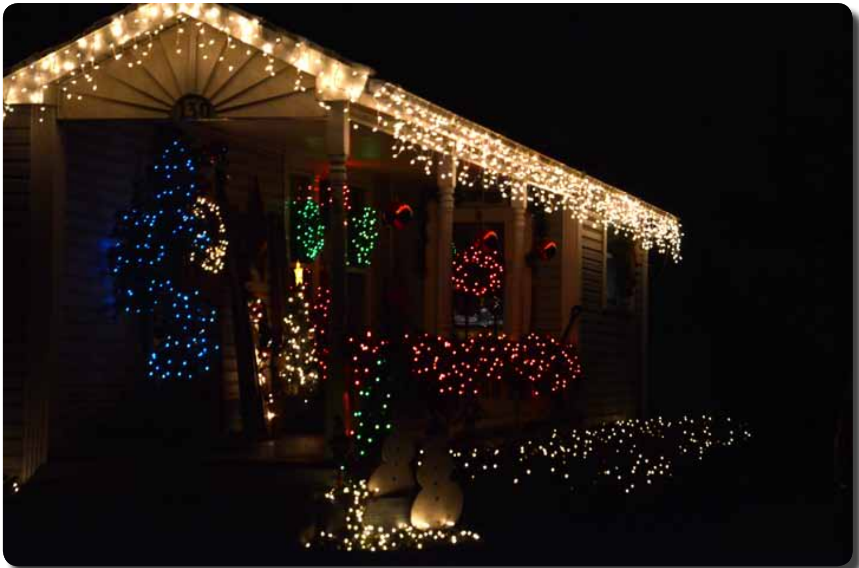
Mayor's Choice - residential lighting winners Brodman residence, 120 Railroad St.