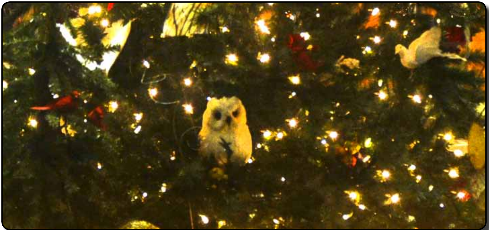
Third place downtown window decorating contest Citizens National Bank, 102 S. Main St.