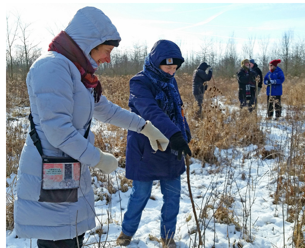
Wild Turkey tracks paraded across the trail at the 2020 GBBC.

Because the weather was less than ideal on January 11, the winter “Full Moon Hike” was held on February 8. We had a full trail of 16 people. A beautiful soft snow fell during much of the event, but the moon did make an appearance as we entered the upland woods’ Nature’s Classroom. Wild Turkey, White-tailed Deer and Fox Squirrel tracks crossed our path and the Huber family heard an Eastern Screech Owl near the cabin.