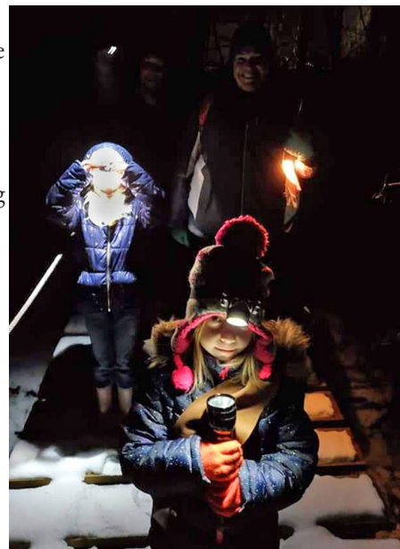
Brownies cross the Cranberry Run bridge.

The February 15 Great Backyard Bird Count (GBBC) installment on The Quarry Farm was cold; 5 degrees F cold. Beautiful, with thick frost and snow and blue sky for the walk, but the cold filtered through Thinsulate, wool and whatever else each of us could layer over our pasty winter skins. Our count from that Saturday and another done on Monday is now part of the official GBBC 2020 observation list.