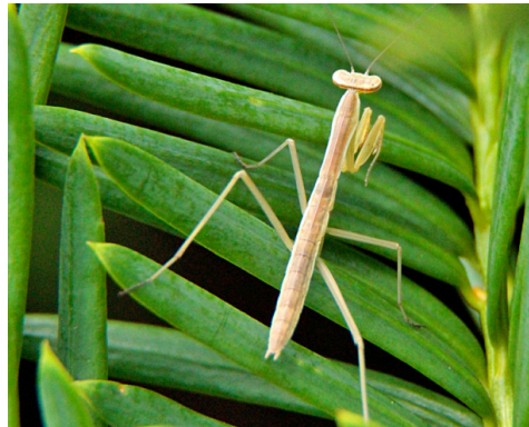
A very young and tiny Praying Mantis prowls a yew for insects outside Red Fox Cabin.

It is our goal and mission to provide the opportunity for people of all ages to increase their understanding of the natural environment of Northwest Ohio and to interact with their fellow inhabitants in a sustainable manner.