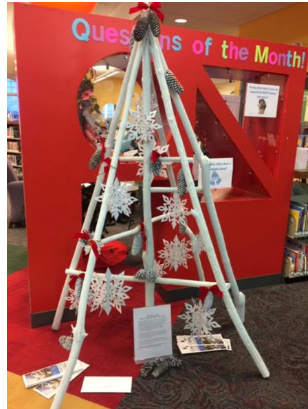
The bush honeysuckle “Christmas Tree” will be used in the vegetable garden this spring and summer.