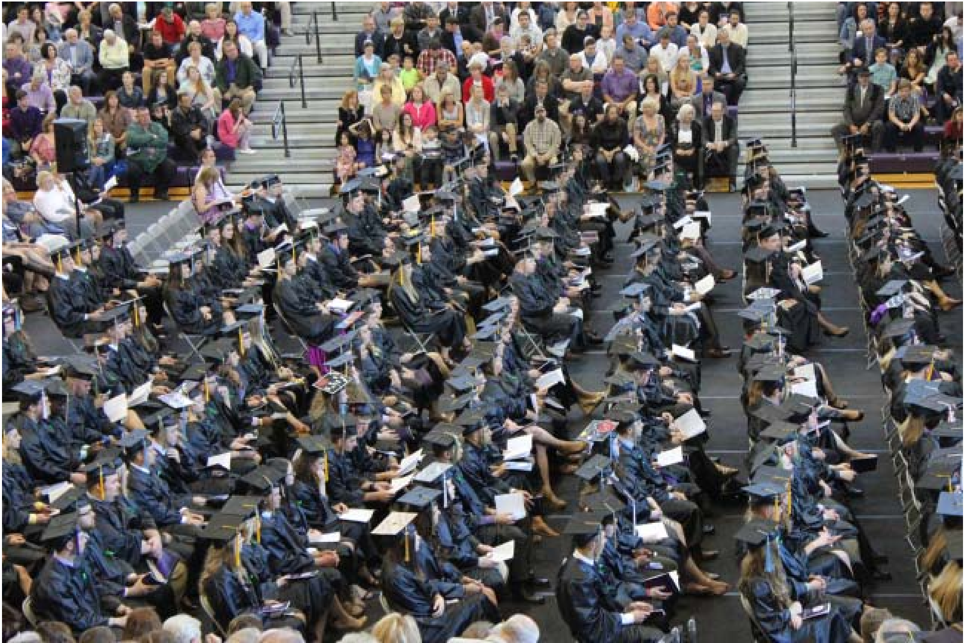
More than 230 students graduated during Bluffton University's 117th Commencement ceremony. An estimated 3,000 people filled Sommer Center to cheer their accomplishments.