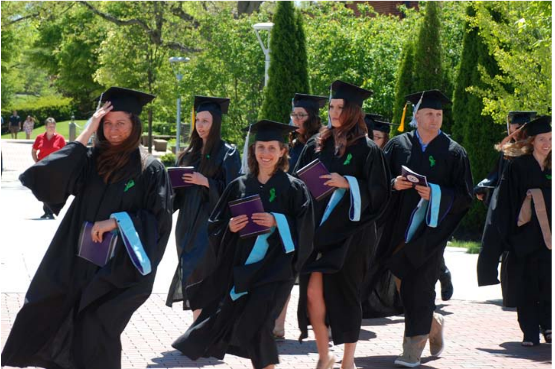
Master of Arts in Education graduates