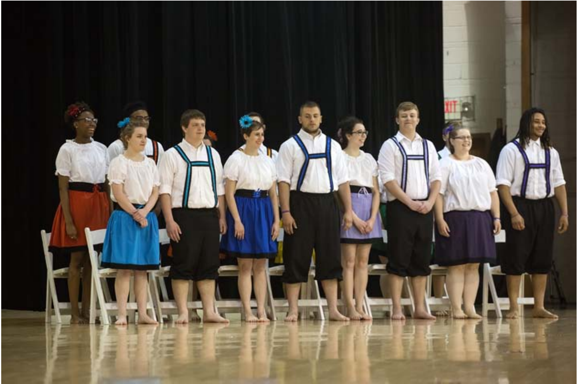
May pole dancers