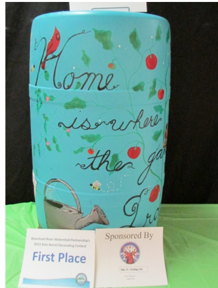
Picture 1 - 2015 Rain Barrel Contest