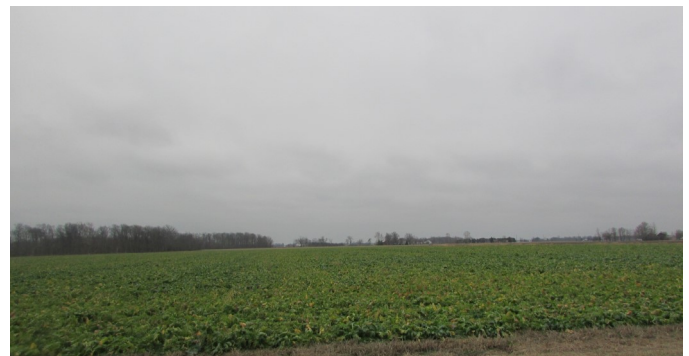
Picture 2 - Oilseed Radish and Austrian Pea