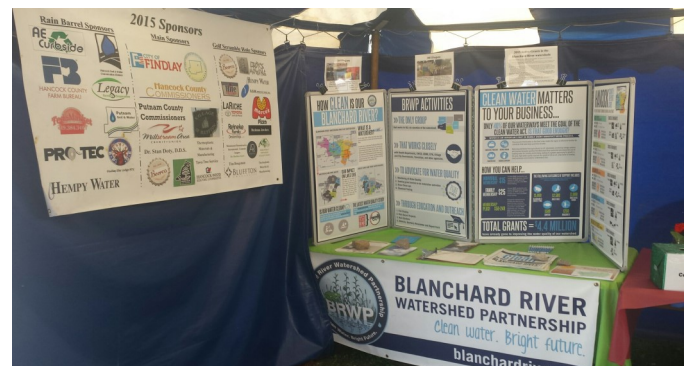
Picture 3 - Fair Display

NEED MORE INFORMATION? Visit our website at www.blanchardriver.org or on facebook at Blanchard River Watershed Partnership to find more information and to get involved.