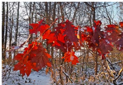
The 2019 Veterans Day winter storm caught fall off guard, turning the changing leaves into something akin to stained glass.

It is our goal and mission to provide the opportunity for people of all ages to increase their understanding of the natural environment of Northwest Ohio and to interact with their fellow inhabitants in a sustainable manner.