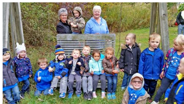
Safe Haven Family Childcare (above) and Kingdom Kids Preschool visited for the first time in October, bringing apples and carrots to share with the animals.