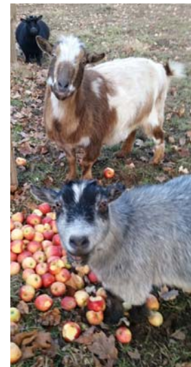
Apples or potatoes simulate fall foraging and boosts healthy calorie intake during early winter.